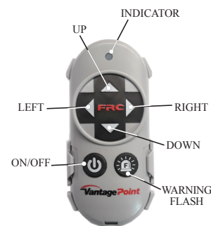
(2) Remote Controls Supplied